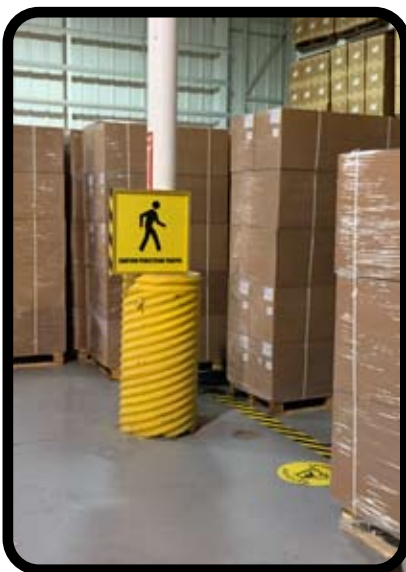
1 Sign is dormant if no pedestrian is present.

For more information please contact us at Info@awp.be