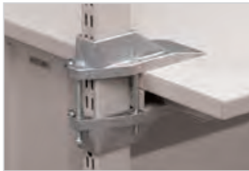
Upright tube with aluminium bracket attached to the bench.