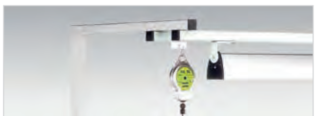
Tool and lighting support KT