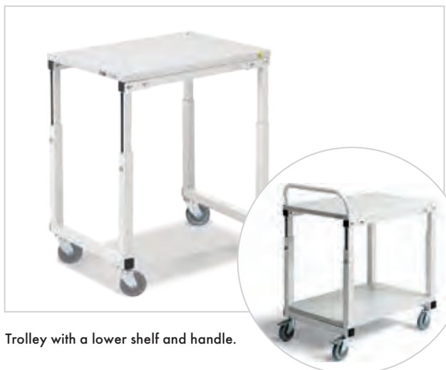
Trolley with a lower shelf and handle.