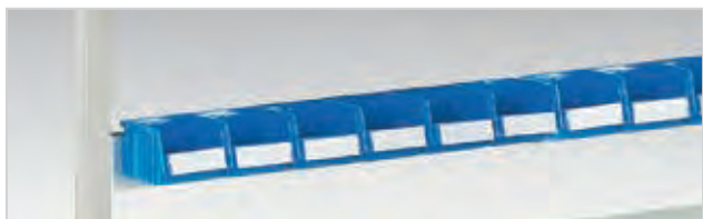
Bin profile BP