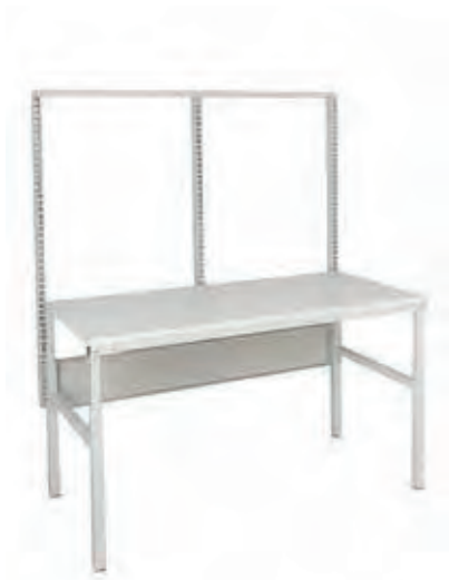
TP workbench Code C 120 41 300