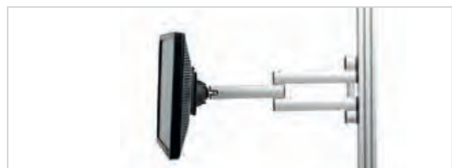
LCD swivel arm MA2

The quick-release mechanism is equipped with the standard, widely used flat-screen mount 75 x 75 and 100 x 100 for the mounting of all normal flat-screens. The arm is double articulated, turns through a radius of 180° and will extend between 95-425 mm from the upright. Connector HKC-MA2 needed for mounting LCD swivel arm MA2 to TPH benches, ordered separately.