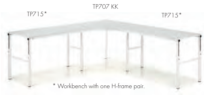
This unit consists of a worktop, two side frames and a leg in the middle. Front side 565 mm.