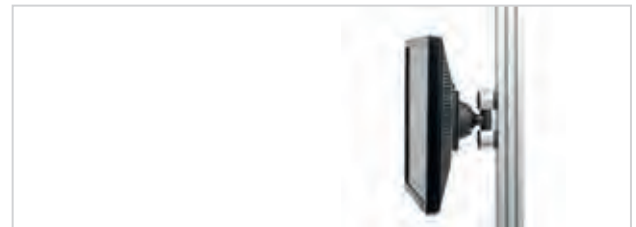
LCD bracket MH

The quick-release mechanism is equipped with the standard used flat-screen mount 75 x 75 and 100 x 100 for the mounting of all normal flat-screens. Connector HKC-MA/MH needed for mounting to TPH benches, ordered separately.