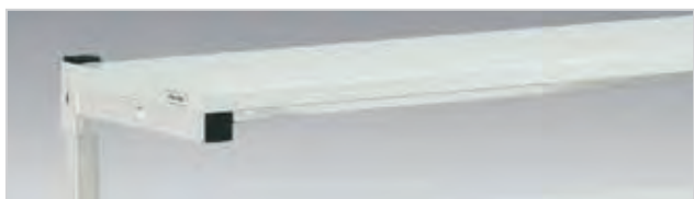
Auxiliary shelf SH