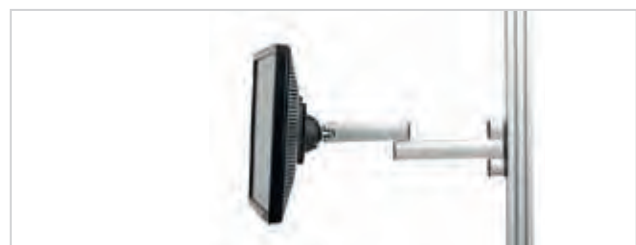
LCD swivel arm MA

The quick-release mechanism is equipped with the standard flat-screen mount 75 x 75 and 100 x 100 for the mounting of all normal flat-screens. The arm is double articulated, turns through a radius of 180° and will extend between 95-425 mm from the upright. Connector HKC-MA/MH needed for mounting LCD swivel arm MA to TPH benches, ordered separately.