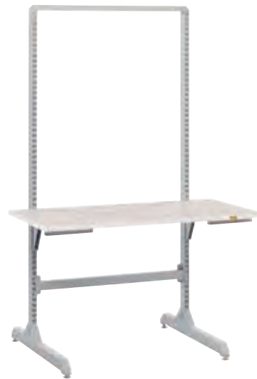
TP upright frame with bench top Code C 123 35 102