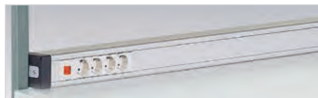
Power channel TJK

Constructed from aluminium profile, this range of compact power channels provides power distribution for TPH benches. Pre-assembled with a choice of components, ordered separately. The power channel is isolated from the workbench. 3 m cable is included. Aluminium profile 72 x 72 mm. All meet with CE requirements.