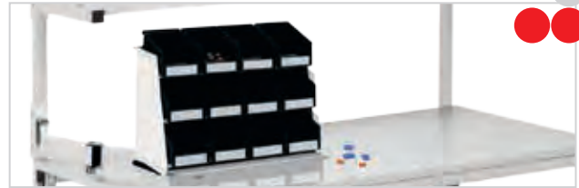
Component rack EPL

Rack with three fixed shelves. Of semiconductive epoxy powder coated steel in light grey (RAL 7035).