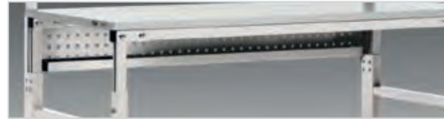
Cable tidy TPHCT

Mounted between C-profiles below worktop. Of perforated epoxy powder coated steel.