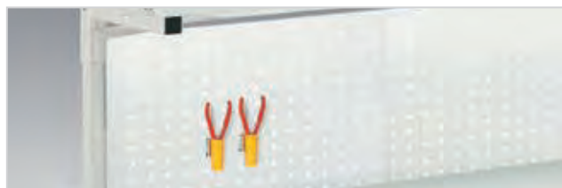
Perforated panel RL