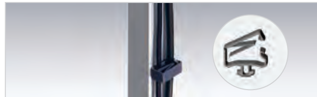
Cable clip set CC

The cable clip set will hold cables etc. securely and neatly in place along the bench frame. The clips locate in the 12 mm profile slot.