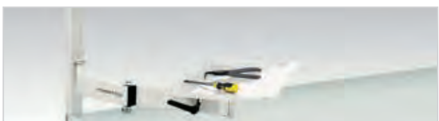
Swivel arm with tray CKV