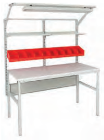
TP workbench Code C 120 41 302