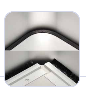
Narrower gap with plastic rim inlay or brush strip