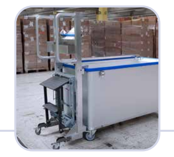
Ladder, push aid, drink holder, scanner holder, label dispenser, writing tablet or clipboard