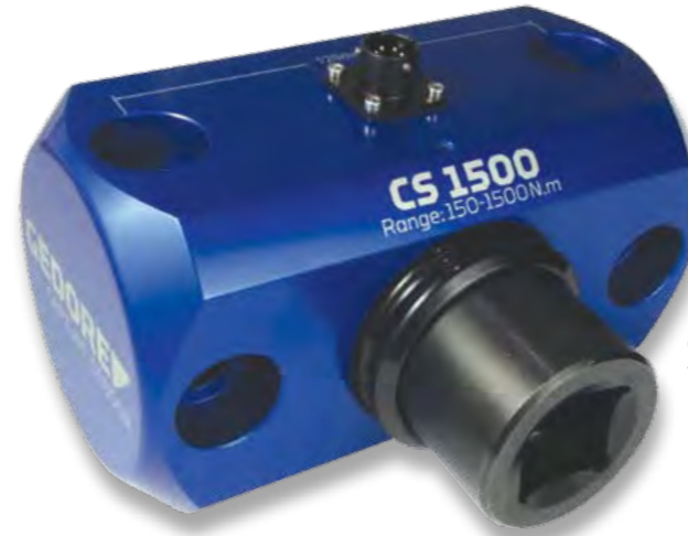
CAPTURE Sensor will change from red to blue in Jan 2017

The CAPTURE Sensor is part of the industry-leading CAPTURE system, providing highly accurate torque measurement for Hand and Power Torque Tools.