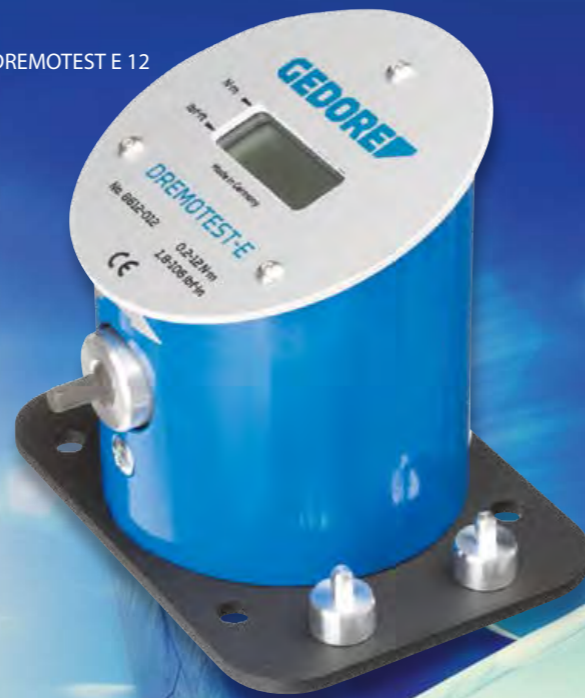
DREMOTEST E 12