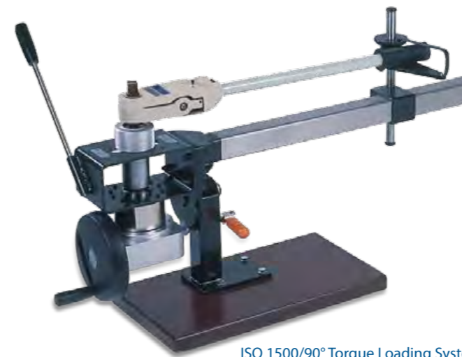
ISO 1500/90° Torque Loading System

ISO accreditation. Meets the International Standard ISO 6789:2003 for the calibration of Torque Wrenches