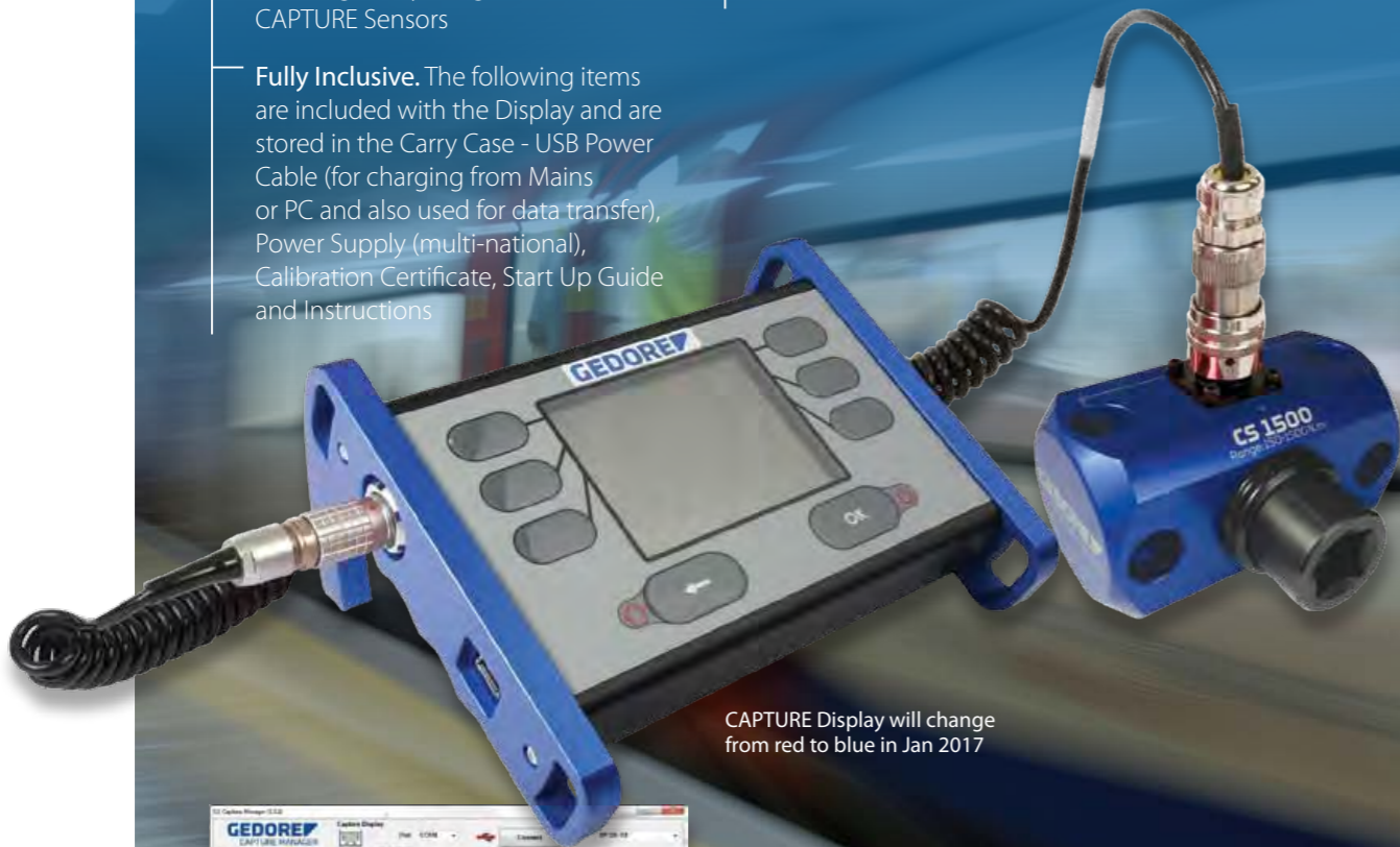
CAPTURE Display will change from red to blue in Jan 2017

Versatility. Design allows static laboratory use and mobile data collection using an onboard memory and rechargeable battery. The data can then be transferred to PC via USB connection